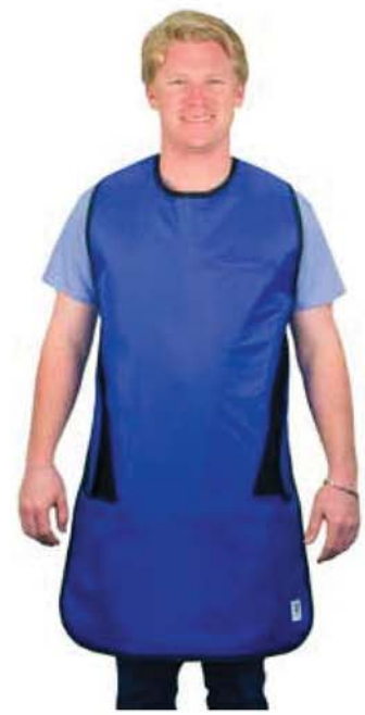
SDO Surgery Drop Off