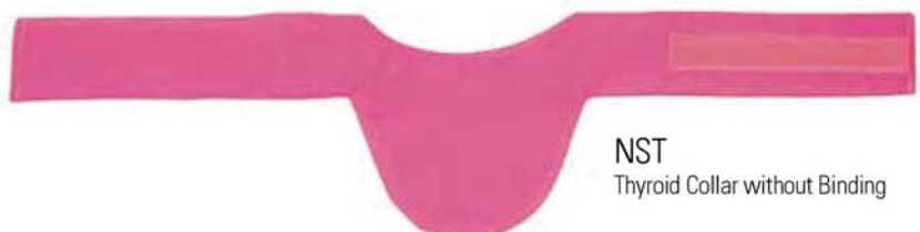
NST Thyroid Collar without Binding