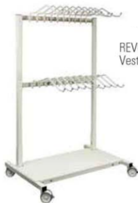
REVOLUTION Vest & Skirt Rack