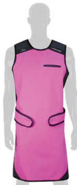
403 Revolution Elastic Back Front