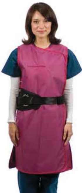
LSW Black Belt Wrap