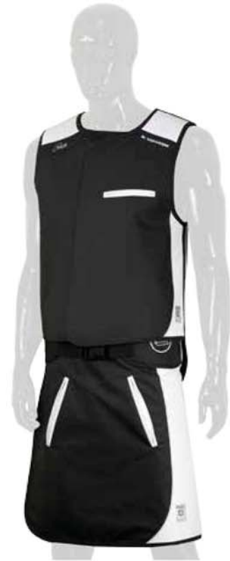
103 Revolution Vest & Skirt