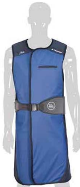
203 Revolution Full Wrap Black Belt