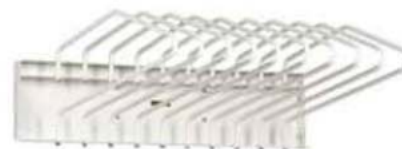
Wall Mounted Rack