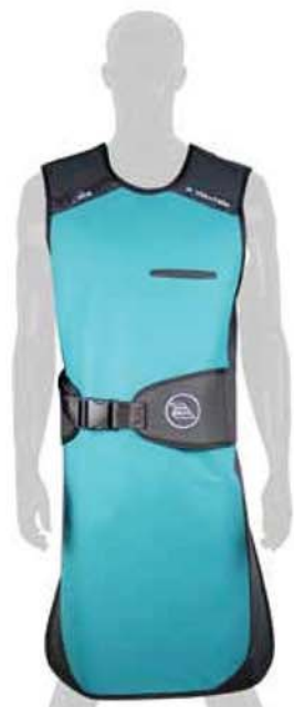
503 Revolution Black Belt Front