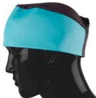
Revolution Elastic Back Thinking Cap