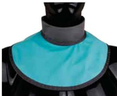
REV-TC Revolution Thyroid Collar