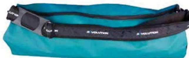
REV-BAG Revolution Apron Bag