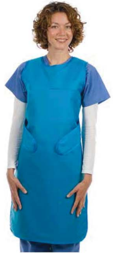
AWC Weight Reliever