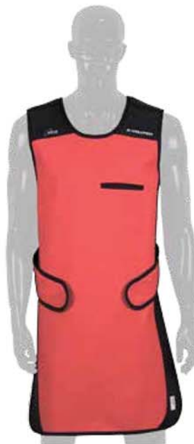
303 Revolution Velcro® Front