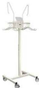
Mini Mobile Apron Rack