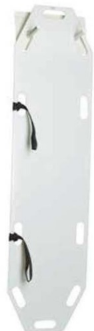
PTD Patient Transfer Device