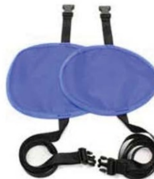
PGS Gonad Shields