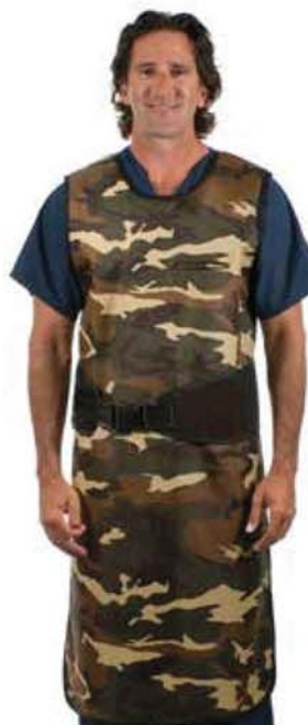
LSF Black Belt Front