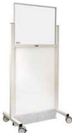
Standard Mobile Barrier