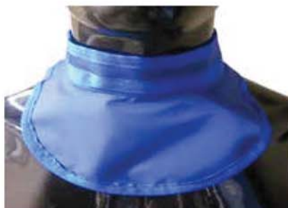
SVT Visor Style Thyroid Collar