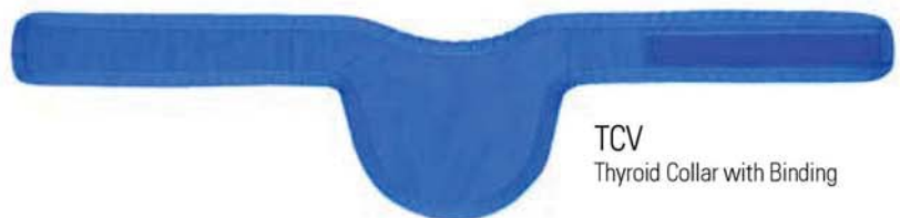
TCV Thyroid Collar with Binding

Infab thyroid collars offer a better fit and a larger area of protection. The Revolution fabric makes for a much more comfortable product that won't irritate the neck even during a long procedure. Different in look, the Revolution Thyroid collar is the only collar that gives you complete protection and total comfort.