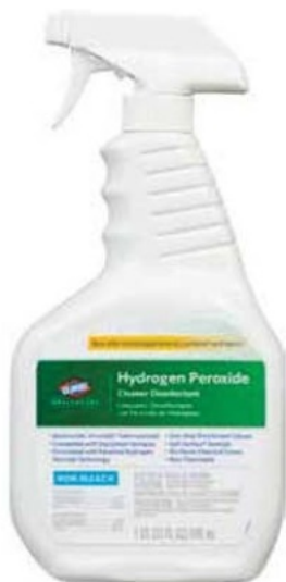
CLX28 Apron Cleaner