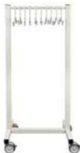
10 Hanger Mobile Apron Valet