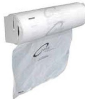
Roll and Rack