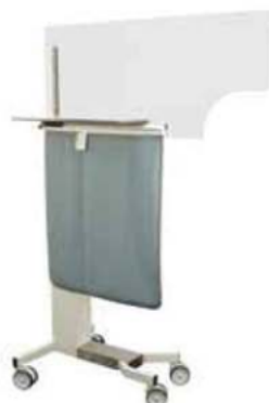
Physician Protection Mobile Screen

Infab Barriers incorporate years of advancements and features to produce industry leading quality, innovation and protection. All barriers are available with either lead glass or acrylic. There are currently 10 different styles to choose from, making it easy to find a barrier that matches your exact specifications. If one of our 10 styles does not meet your specifications, we will work with you to create a custom barrier that can fit any desired size. With over 30 years of experience we know we can help you build exactly what you need.