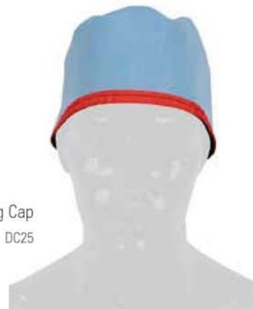
Disposable Thinking Cap DC25

The only lead free core material which passes DIN (6875-1), ASTM (F3094-14) and IEC (61331-1-2014) standards from 50 to 150 kVp.