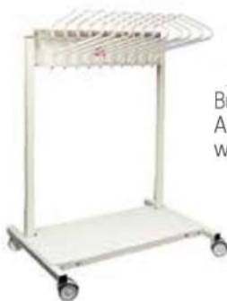
Budget Mobile Apron Rack with 10 Arms