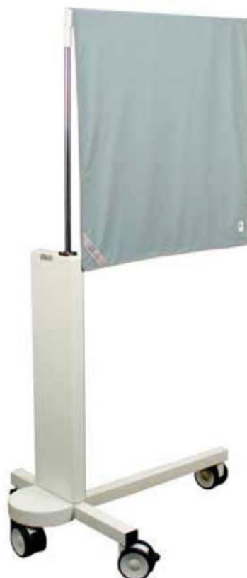
REVOLUTION Premium Mobile Curtain REV-PMC