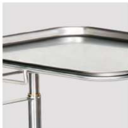
Removable tray for easy cleaning