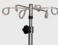
6-Hook Ram's Horn Top: For use in specialty applications where several different IV Bags are needed.