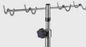
8-Hook Rake Top: For use in specialty applications where several different IV Bags are needed.