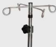
4-Hook Ram's Horn Top: For standard applications.