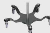
5 Leg Spider Low Center of Gravity Base: 22" diameter Available in five standard colors For infusion pumps when paired with SS Pole.