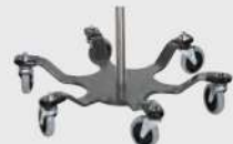
6 Leg Spider Low Center of Gravity Base: 22" diameter Available in five standard colors For infusion pumps when paired with SS Pole. Most stable pole and best elevator transition.