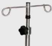
2-Hook Ram's Horn Top: For light use areas.