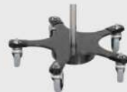
5 Leg Weighted Base: 16" diameter Available in five standard colors. For infusion pumps when paired with SS Pole.