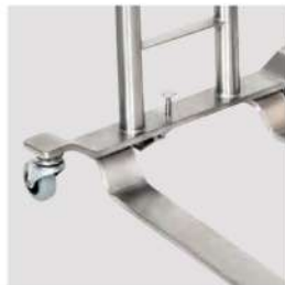
Foot pedal adjusts height from 36" to 62"